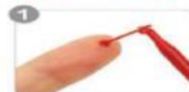
Blood sample preparation