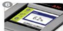
Read the result