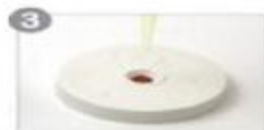
Apply the sample and washing solution