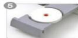
Insert the cartridge