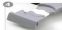
Initiate automatic tray